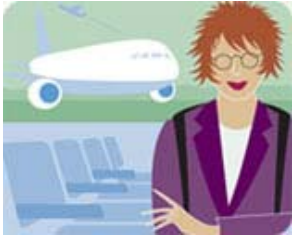
I love to travel