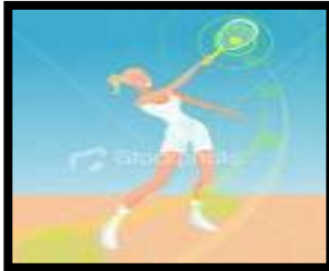
I want to stay active