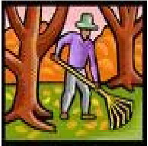
I have work to do