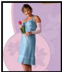
It just feels GOOD!