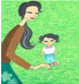
I want to stay healthy